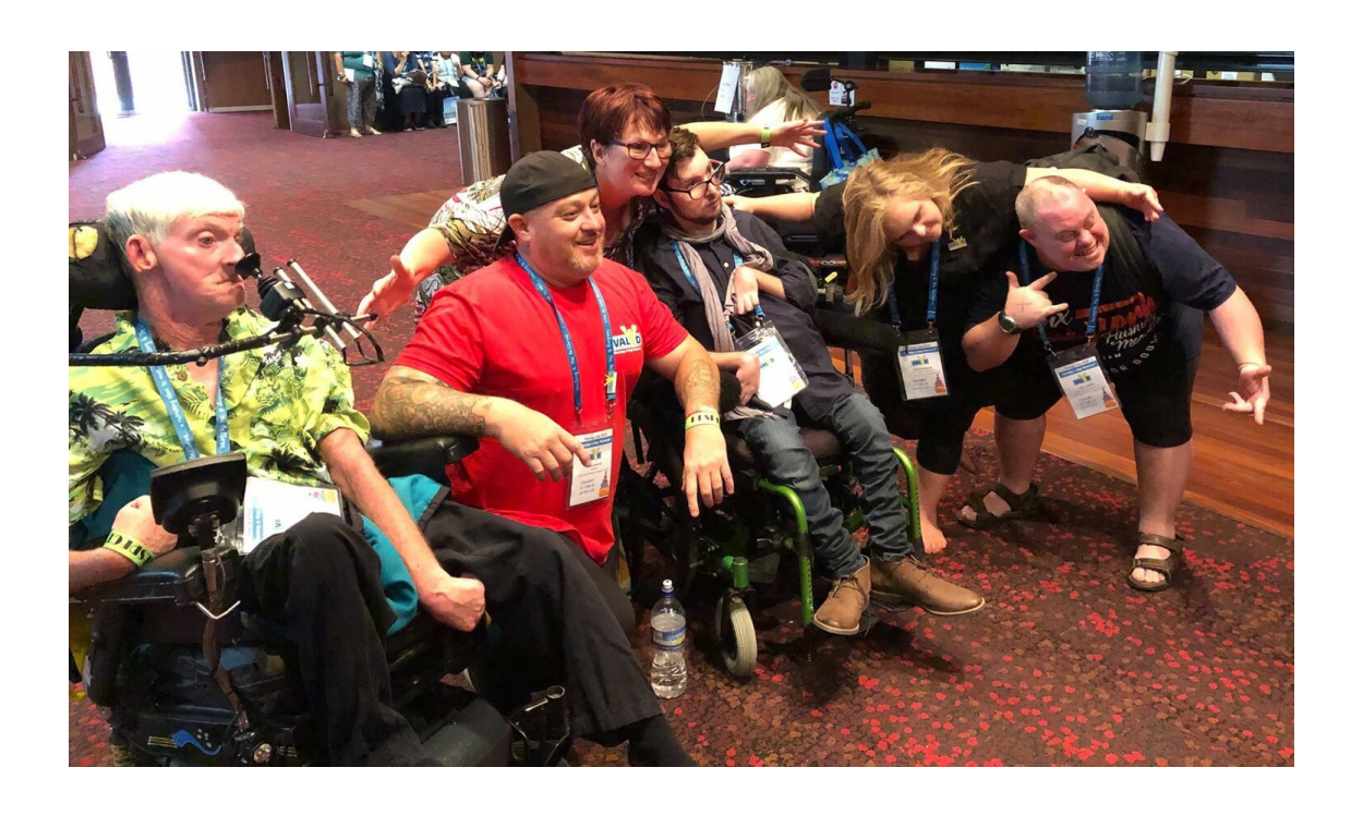
Image Description: A photo of Speak Up Hunter peer group at the 2019 'Having A Say' Conference in Geelong