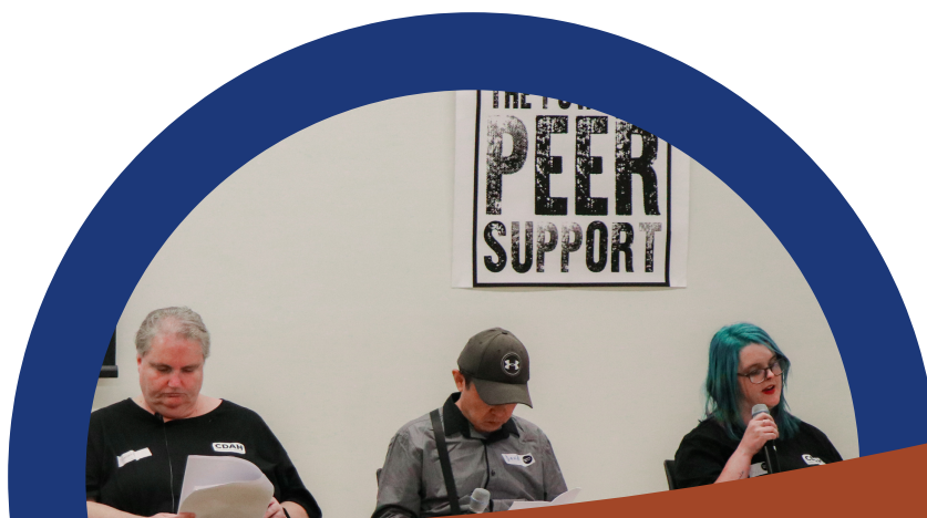
Photo Peer researchers at the Together we Can conference

Thank you to everyone for all their hard work over the past two years!