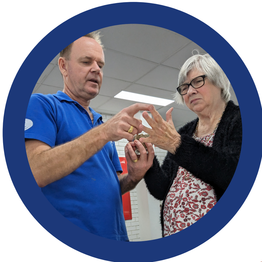
Interpreter doing tactile Auslan with a Deafblind peer

“Our communication styles require an interesting and complex mix of interpreters and support but despite the challenges we all enjoy the group so much. Over the last four years we have built strong, supportive relationships with each other that have helped boost our confidence and self-esteem. Our vision for the group is to see it continue to develop the social relationships between members, to increase knowledge and skills of group members, to improve exchange of experiences and ideas but also to promote confidence, reduce isolation and loneliness and to act as peer mentors to each other and other people who are deafblind.”