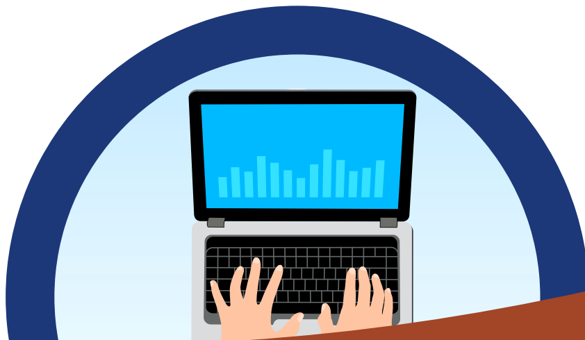
Image of a keyboard with hands typing