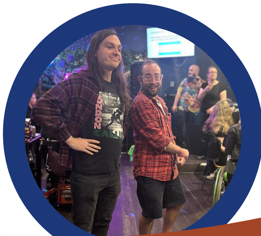
Photo of queer peer coordinators at the queer trivia night