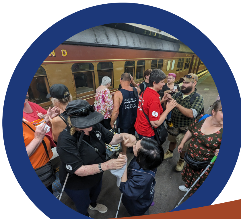
Photo Deafblind Social Group on picnicTrain excursion to train from Maitland