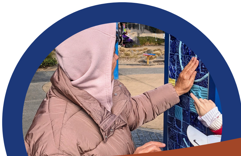
Photo of a Deafblind person touching the Art installation at Lake Macquarie

The team have had a strong focus on developing event management processes that support CDAH to identify, plan and facilitate events. This has this ensured CDAH is in a strong position to engage with peers, community and partners. This has also provided opportunities for peers to be mentored in event organising using a considered and tested approach. The experience and processes developed by the Events and Engagement team places CDAH in a strong position to continue to connect and engage new peers in 2024 and beyond.