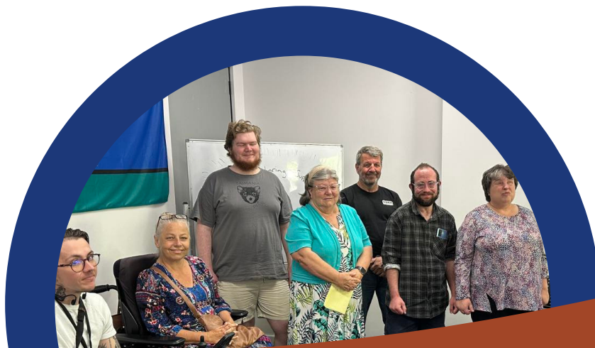
Photo of Peers graduating as Peer Mentors

It has been a great year for our peer community, I am really looking forward to next year and continuing to build our peer mentor network.