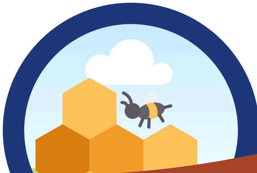
Image of honeycomb and a bee